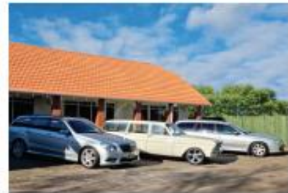
A range of hearses are available for the final ride.